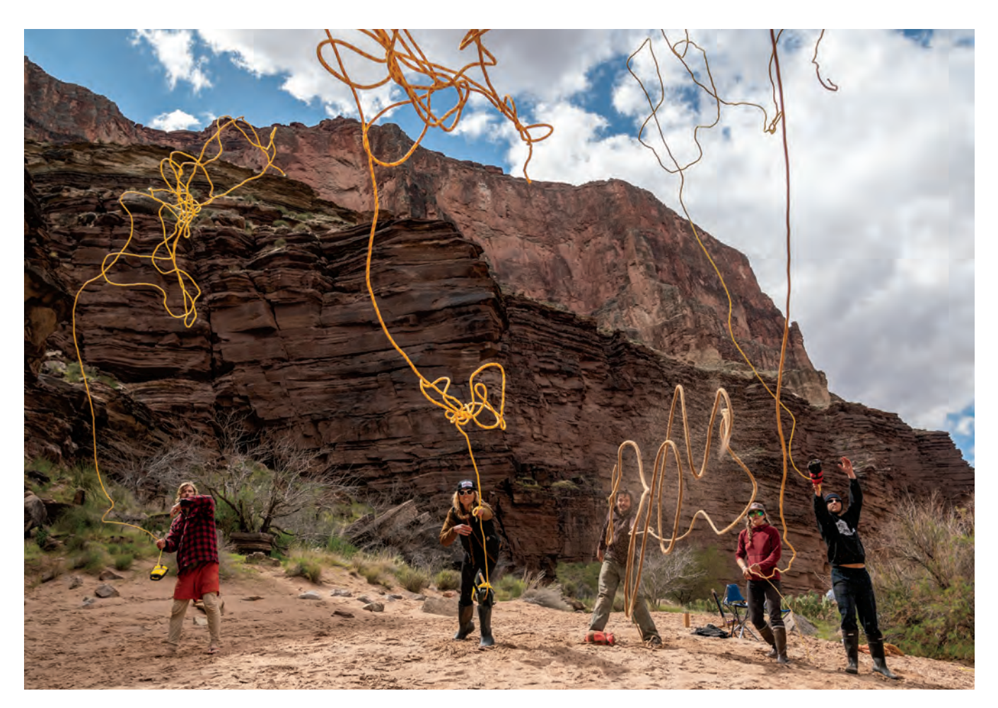
LEFT: One of the expedition's boats makes its way into Ledges Camp, at river Mile 152, at the end of the day. This camp is about 5 miles upstream from where Havasu Creek empties into the Colorado. ABOVE: Guides practice throwing rope coils on the shore before attempting to do so in the water.

Our trip is but one of many training activities that go on each year; several outfitters run similar trips. Grand Canyon River Guides, a nonprofit, orchestrates a huge seminar each year near Marble Canyon — a two-day, land-based event with up to 500 guides in attendance, followed by a river trip with guides from nearly every company. Several organizations offer wilderness first-responder and swift-water training each spring. In the western Grand Canyon, the Hualapai Tribe runs one-day river trips and hosts its own medical and swift-water training.