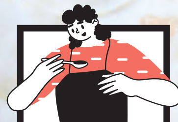
STEAK All steaks are served with bone marrow herb butter