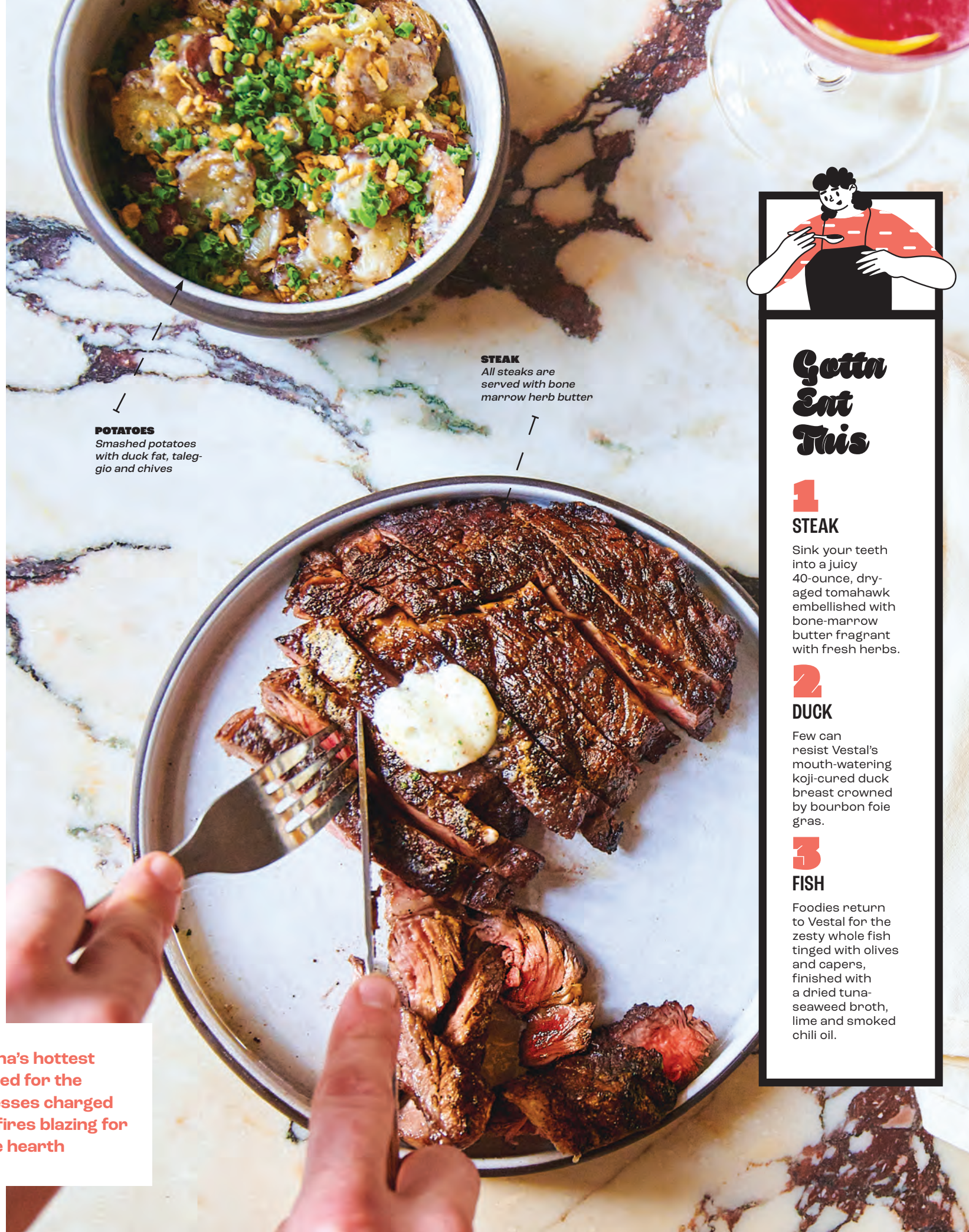
POTATOES Smashed potatoes with duck fat, taleggio and chives

Live fire fuels Acadiana's hottest new restaurant, named for the Roman Vestal priestesses charged with keeping sacred fires blazing for Vesta, goddess of the hearth