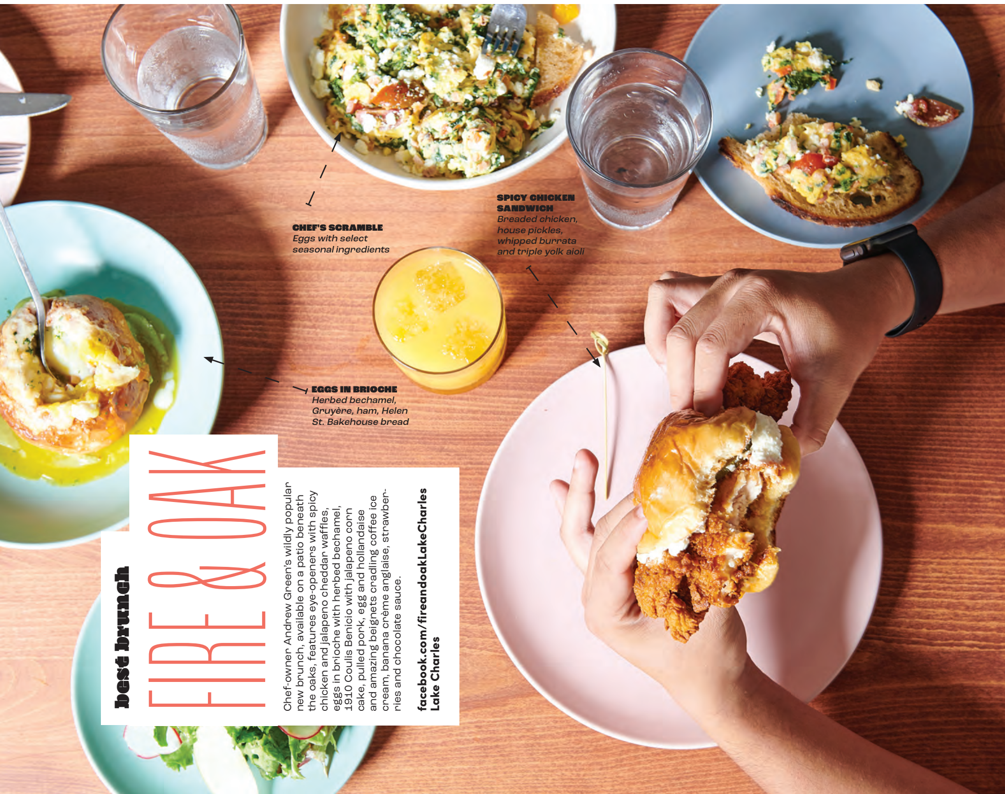
CHEF'S SCRAMBLE Eggs with select seasonal ingredients