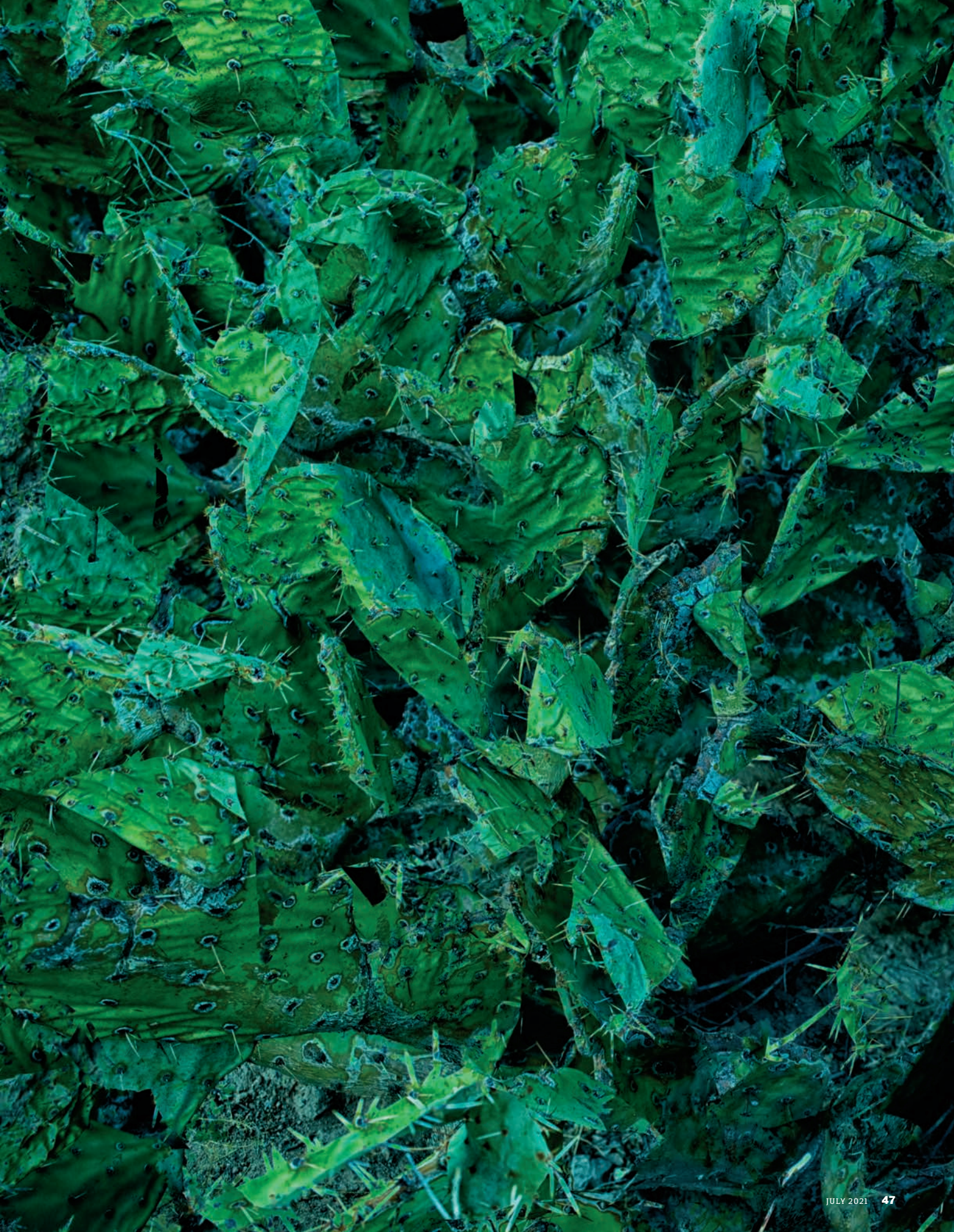
RIGHT: A multiple-exposure shot captures cacti at McKelligon Canyon.