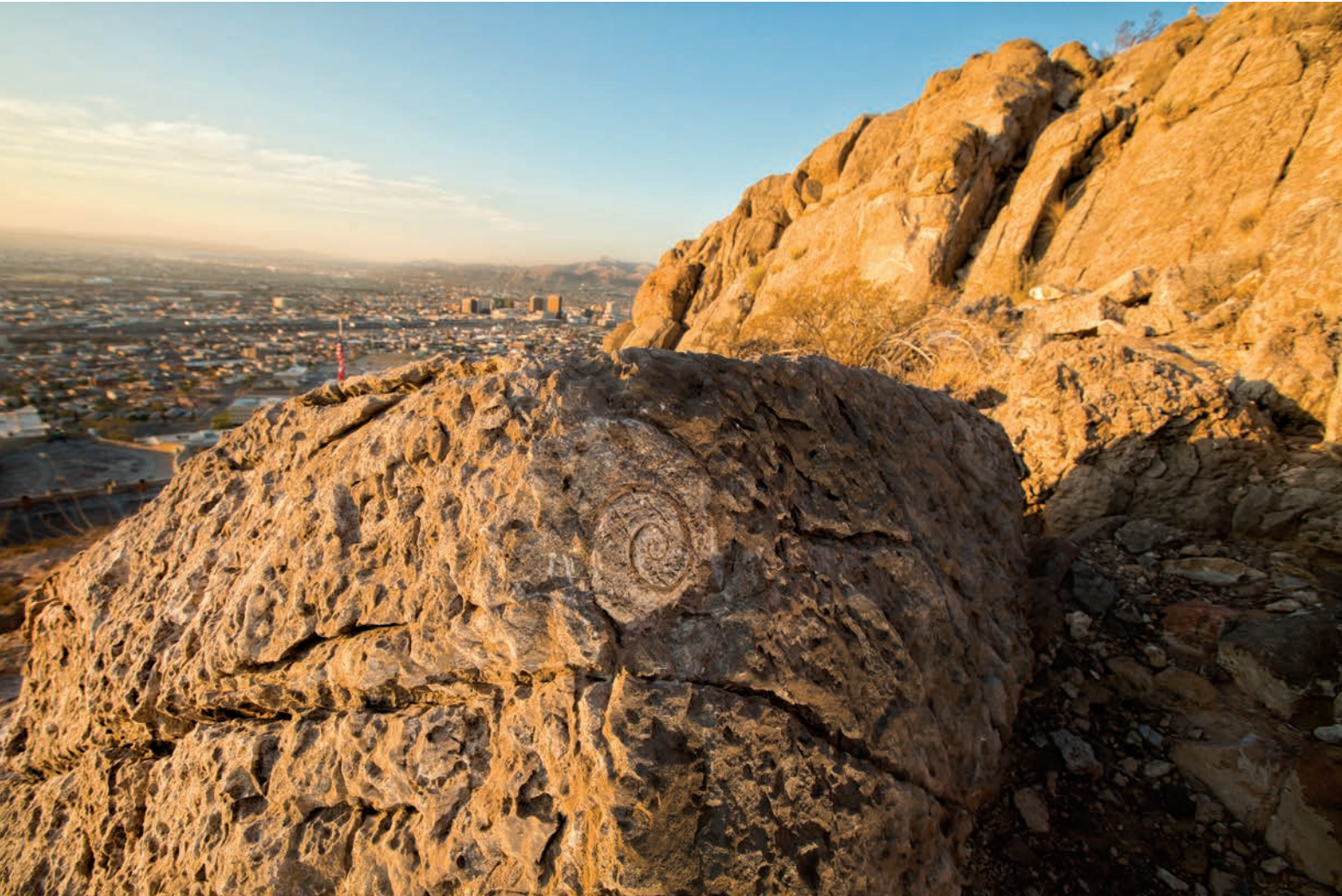
LEFT: An ammonite fossil is embedded into rock near Scenic Drive, with El Paso in the background.