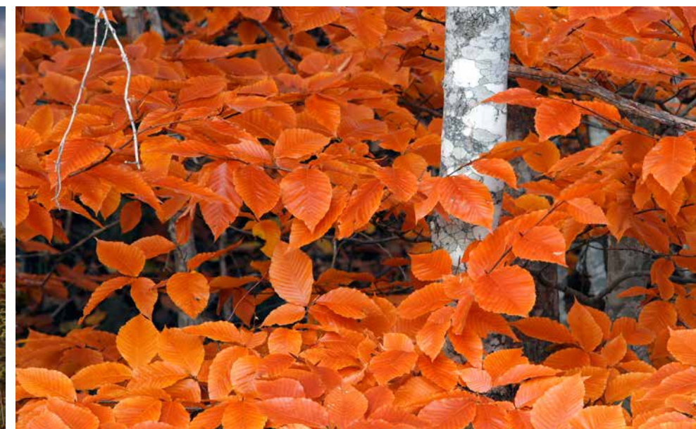
An American beech shows-off its unmistakable copper leaves of autumn. This declining species is found in drier places throughout the Mersey River watershed.