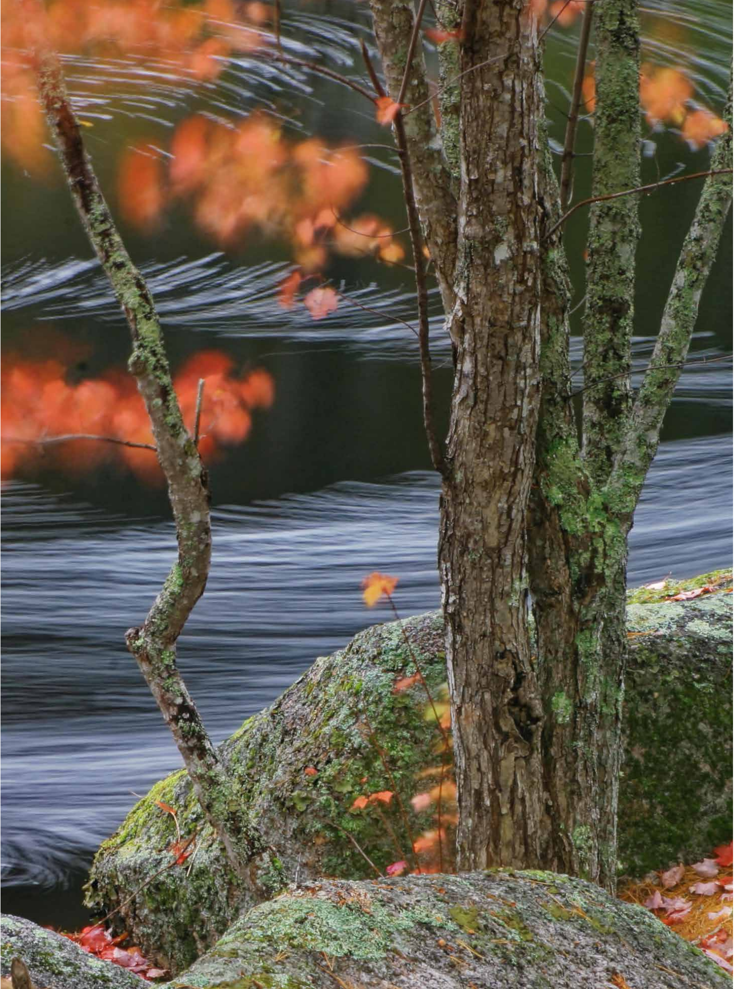
Above: The Mersey River is a source of water for many lakes as it flows north to south. Right: The fleeting annual show of mushrooms peaks when the forests along the river are damp with fall rains.