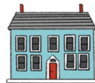
5-bedroom 1813 Federal in Kennebunk: $995,000