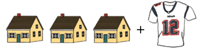
about the cost of three Limestone Capes and a signed Tom Brady Super Bowl jersey purchased at auction