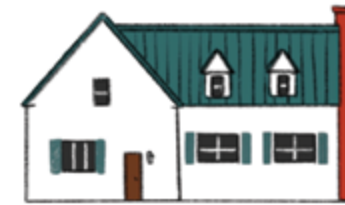
3-bedroom farmhouse in Deer Isle: $289,000