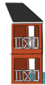
1-bedroom waterfront condominium in Portland: $629,000