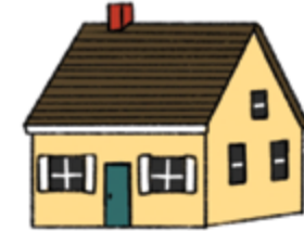
3-bedroom Cape in Limestone: $84,900

A few price comparisons from across the state (in terms tailor-made for Mainers).