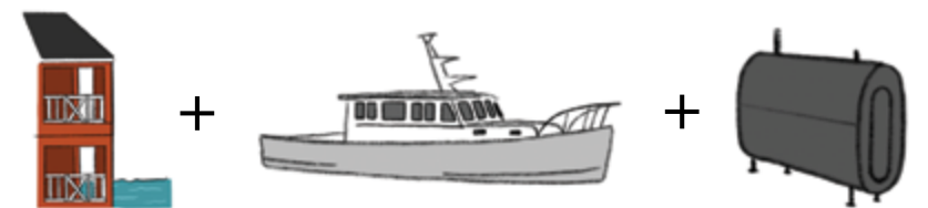
about the cost of a Portland waterfront condominium, a brand-new 38-foot Calvin Beal lobsterboat, and enough heating oil to heat the average Maine home for 7½ winters . . . or your new Federal mansion for maybe two or three