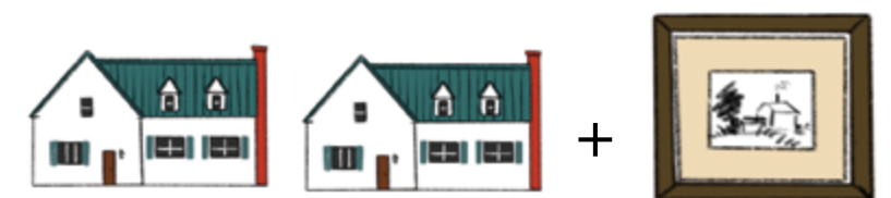
about the cost of two Deer Isle farmhouses and an original Andrew Wyeth India-ink drawing purchased at auction