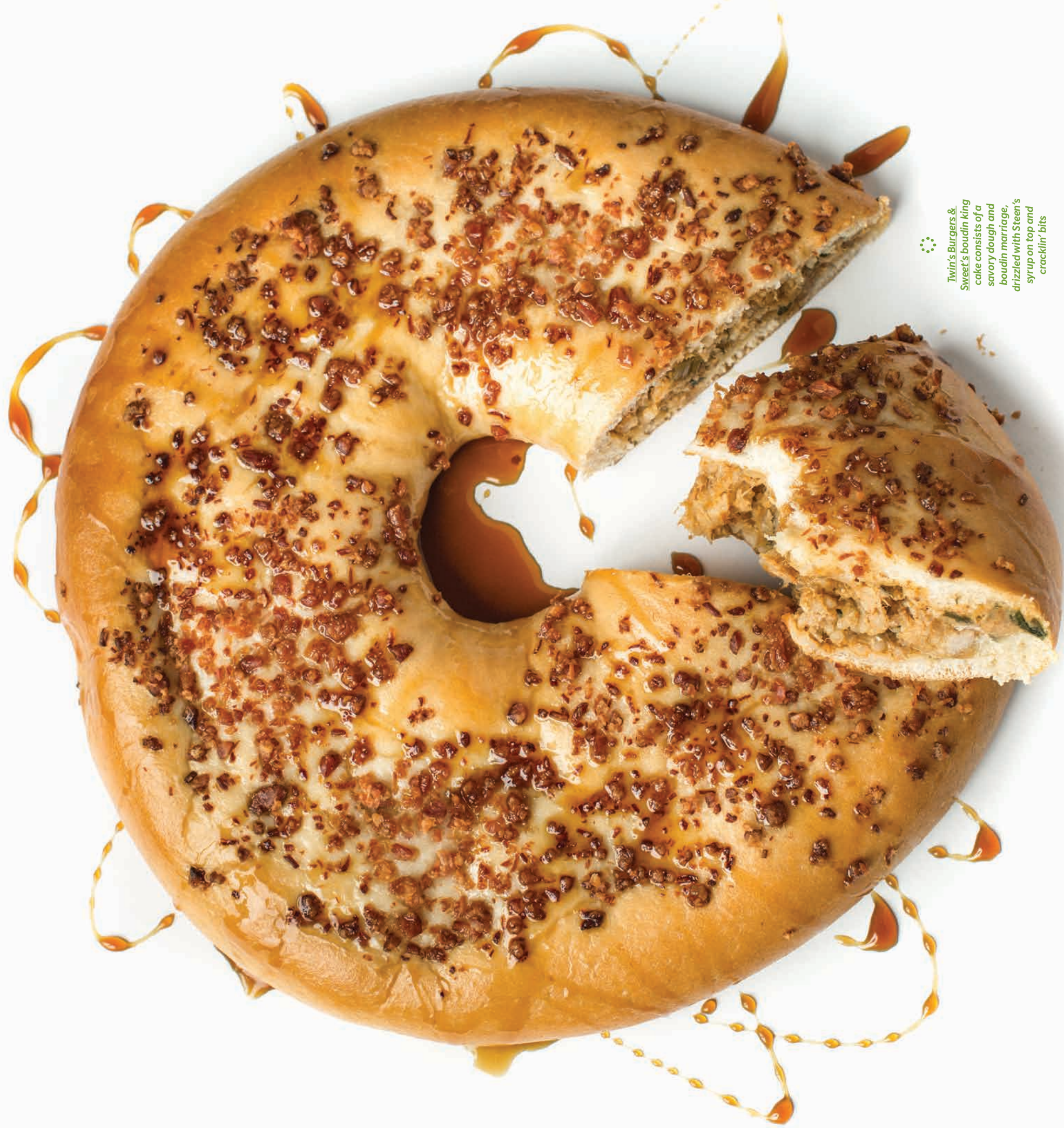
Twin's Burgers & Sweet's boudin king cake consists of a savory dough and boudin marriage, drizzled with Steen's syrup on top and cracklin' bits

LOUISIANA'S TOP, INDIGENOUS BAKED CONFECTION IS THE KING CAKE AND THIS CARNIVAL SEASON, WE'RE EXPLORING ITS EVOLUTION THROUGHOUT THE STATE.