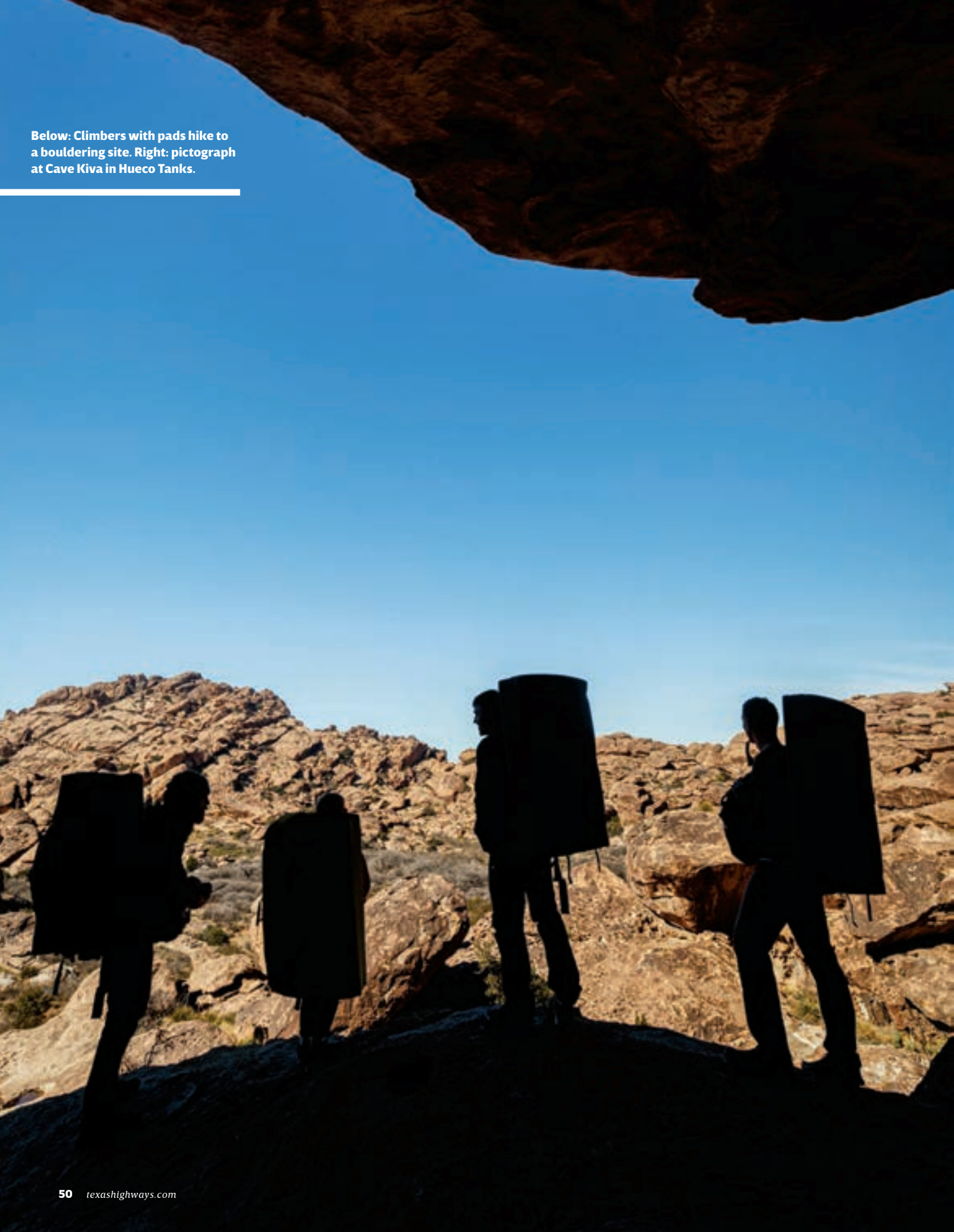
Below: Climbers with pads hike to a bouldering site. Right: pictograph at Cave Kiva in Hueco Tanks.