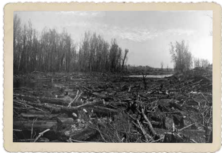
FROM LEFT: The Great Raft, seen here in the 1870s, was an epic logjam dating back centuries and stretching more than 100 miles; low water levels reveal character and beauty not often recognized.

The most puzzling part of Caddo's history is why it's there at all. It has survived for 200 years in spite of many interventions that should have killed it.