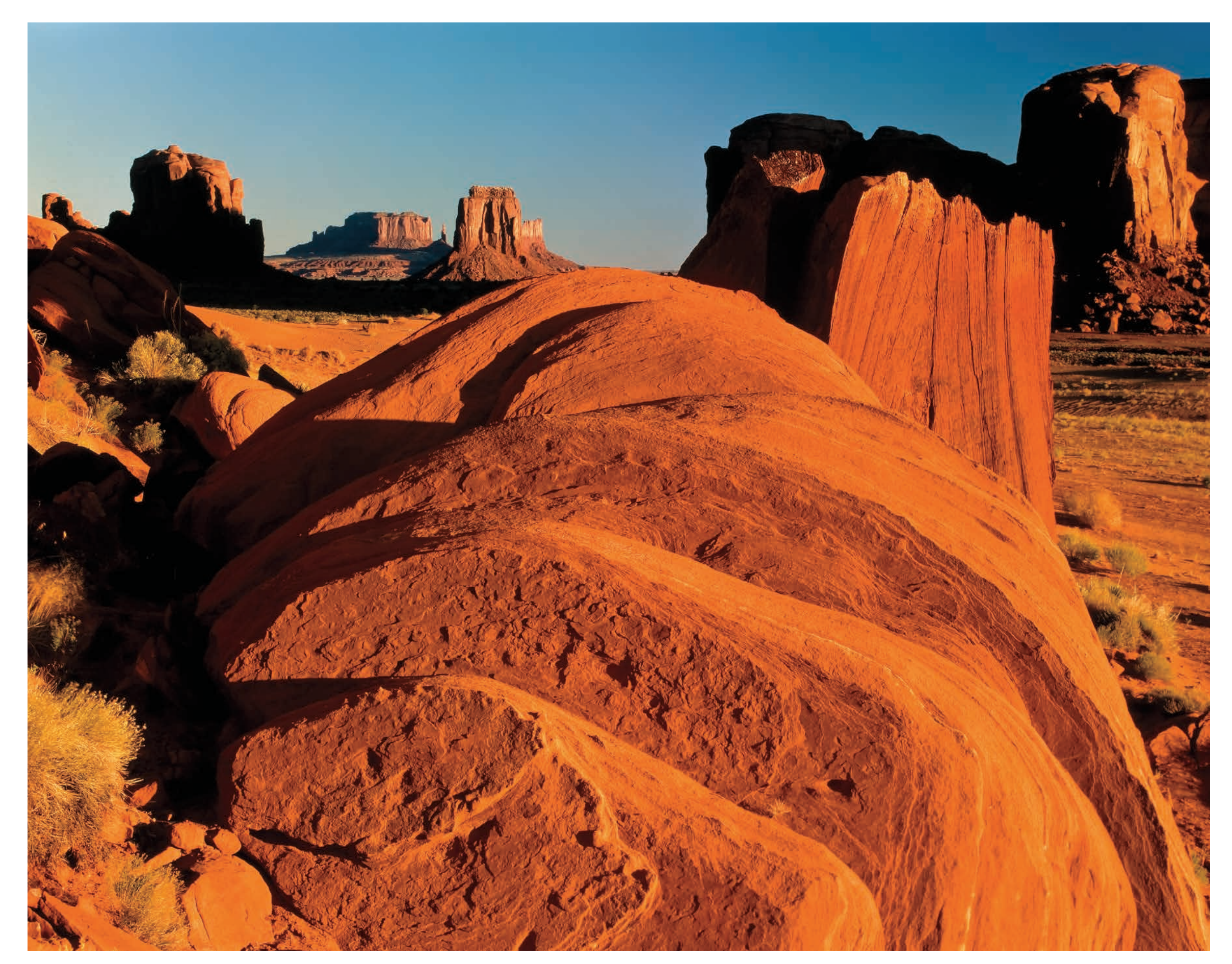
Monument Valley is a jumble of striking rock formations. The geologic layers that form the valley's buttes include Organ Rock shale, de Chelly sandstone and Moenkopi formation.