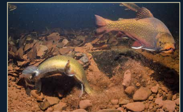
Top: Two males swim upstream towards the spawning grounds. Left: Large sea-run brook trout (female, middle left) and male (front) stage near the edge of their redd in preparation for spawning. Right: A female brook trout sweeps away a depression in the river bottom to create her nest or "redd."