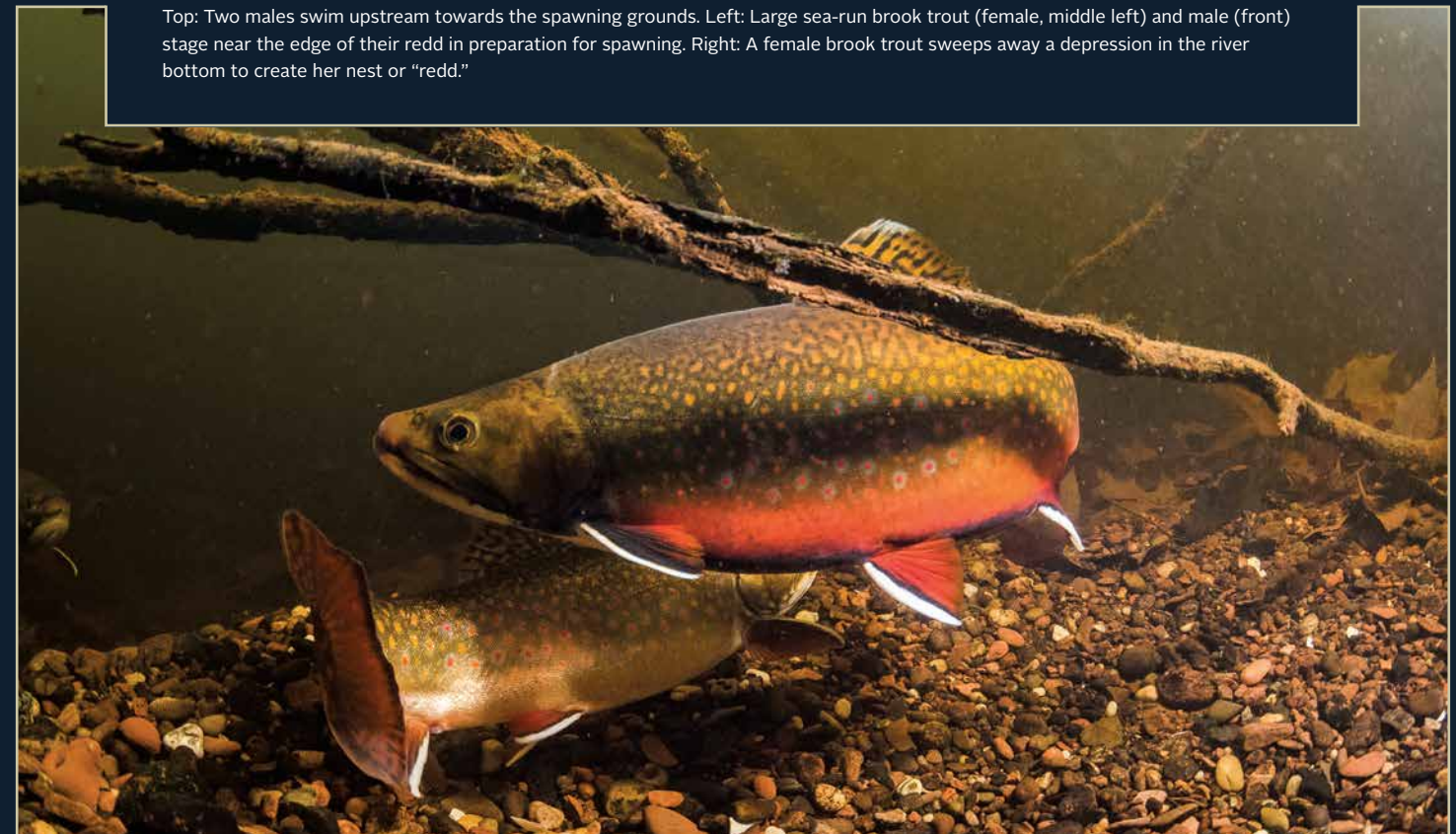
A female ready to spawn tips gently onto her side as a male guards her from an intruding male seen at the edge of the photo.