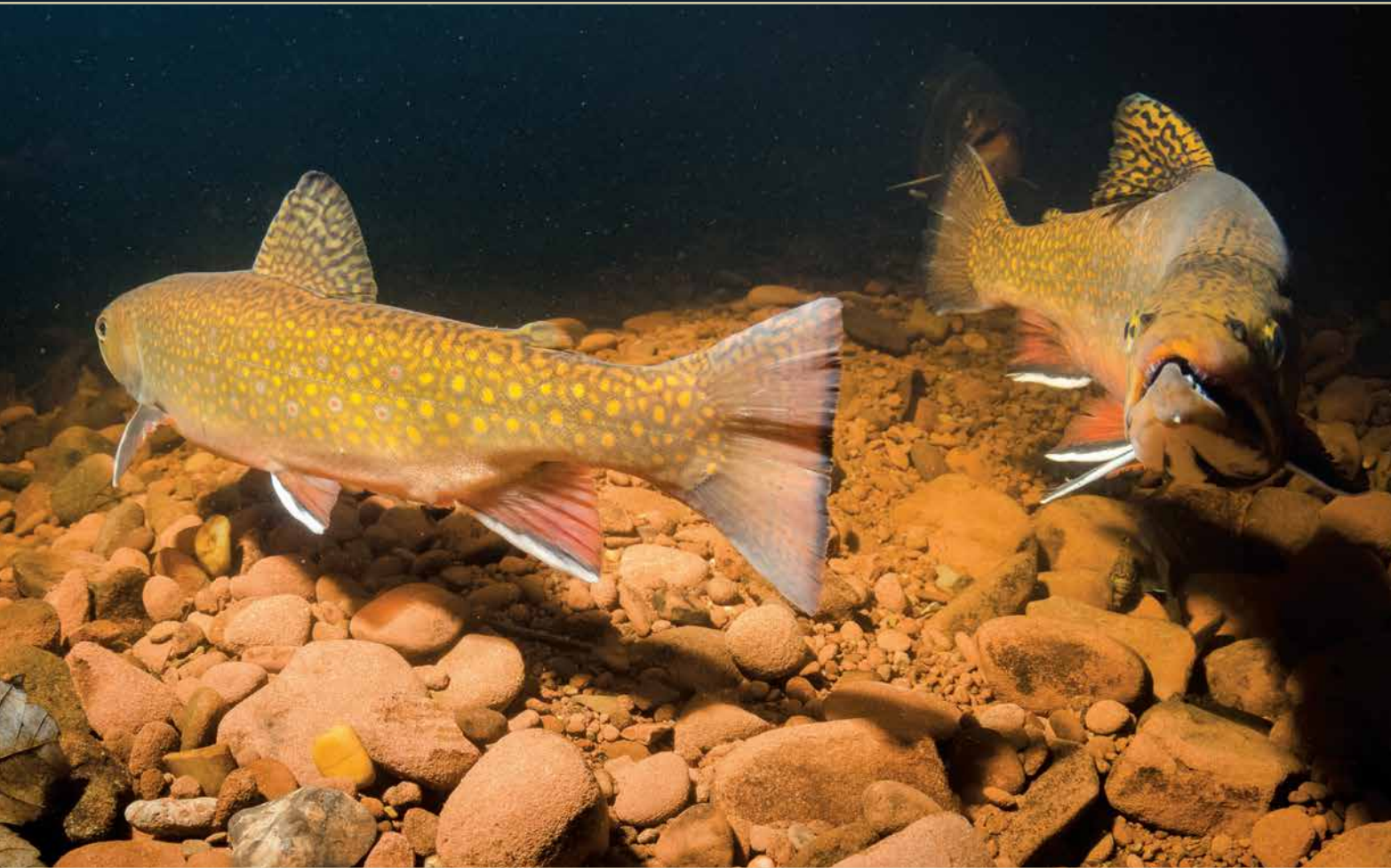
Males initiate the courtship routine by persistently swimming circles around the female, tossing in an occasional body quiver to express their intents.

shore marine environment before re-entering fresh water to spawn. This behaviour, known as anadromy, results in these well-fed individuals often reaching tremendous size.