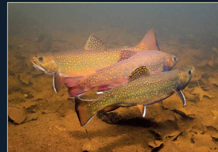
Above: Several sneaker males kick up silt as they try to spawn with a female while going undetected by the large, dominant male. Right: Three males posturing.