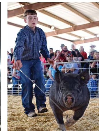
County fairs celebrate the skills of rural life, including homemade jams, championship hogs, and down-home tunes.