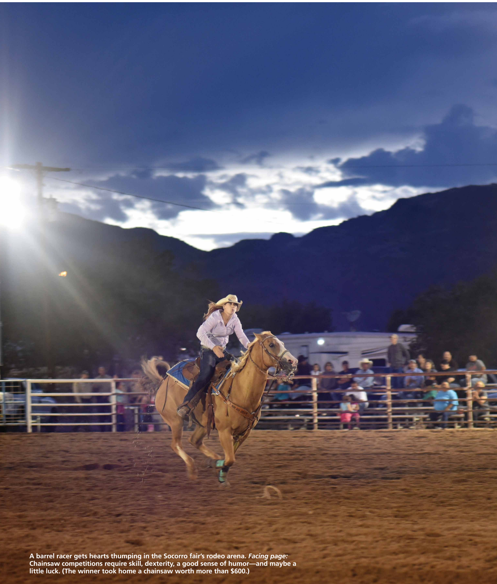
A barrel racer gets hearts thumping in the Socorro fair's rodeo arena. Facing page: Chainsaw competitions require skill, dexterity, a good sense of humor—and maybe a little luck. (The winner took home a chainsaw worth more than $600.)