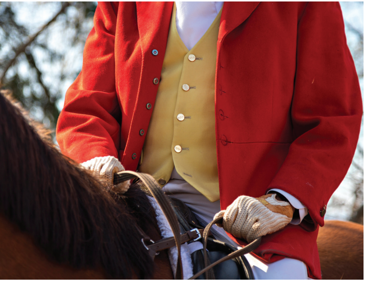
ACCOMPLISHED EQUESTRIANS, FIELD RIDERS JUMP OBSTACLES AND RIDE AT A HARD GALLOP IN ORDER TO STAY CLOSE TO THE HOUNDS AND THEIR WILD QUARRY, WHICH INCLUDES MOSTLY COYOTE WITH AN OCCASIONAL FOX OR BOBCAT. SECOND FIELD HORSEMEN FOLLOW THE CHASE BY MOVING THROUGH GATES RATHER THAN JUMPING, OFTEN AT A FAST CANTER, WITH IN EARSHOT OF THE PACK, AND SOMETIMES EARN A VIEW OF WILD COYOTE. HILLTOPPERS RIDE SLOWLY, HACKING FROM HILLTOP TO HILLTOP, ENJOYING THE OPEN FIELDS AND DEEP BASS TONES OF BAYING HOUNDS.

"There are three kinds of riders: those that live for the hounds, those that favor horses and riding, and those that put up with hound and horse so they can get to the breakfast."