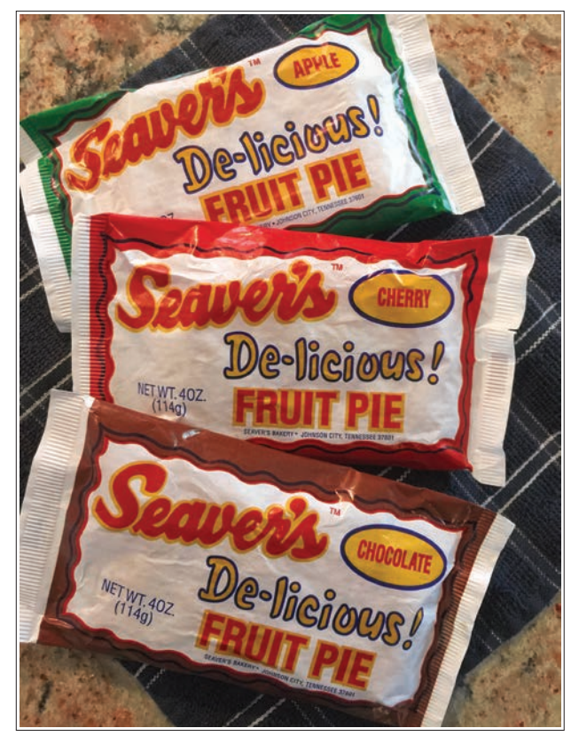
All the wrappers, even for the chocolate pies, say "fruit pies" at Seaver's Bakery in Johnson City. Tennessee.

Route sales went by the wayside long ago, and the Seaver's business may have, too, were it not for the regional grocery chain Food City, based in Abingdon, Virginia. Each store is now stocked with a full line of Seaver's pies.