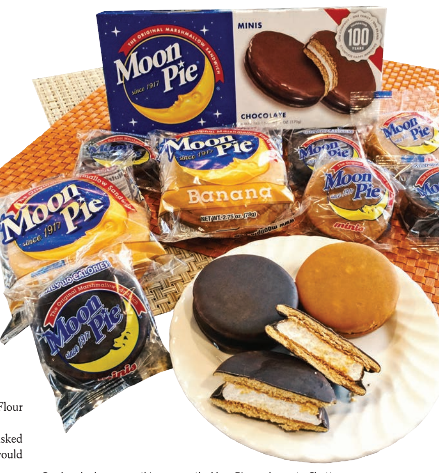
One hundred years ago this summer the MoonPie was born at a Chattanooga Bakery. The world-famous treat has been made there ever since.

"Give me an RC Cola and a Moon Pie (And Play 'Maple on the