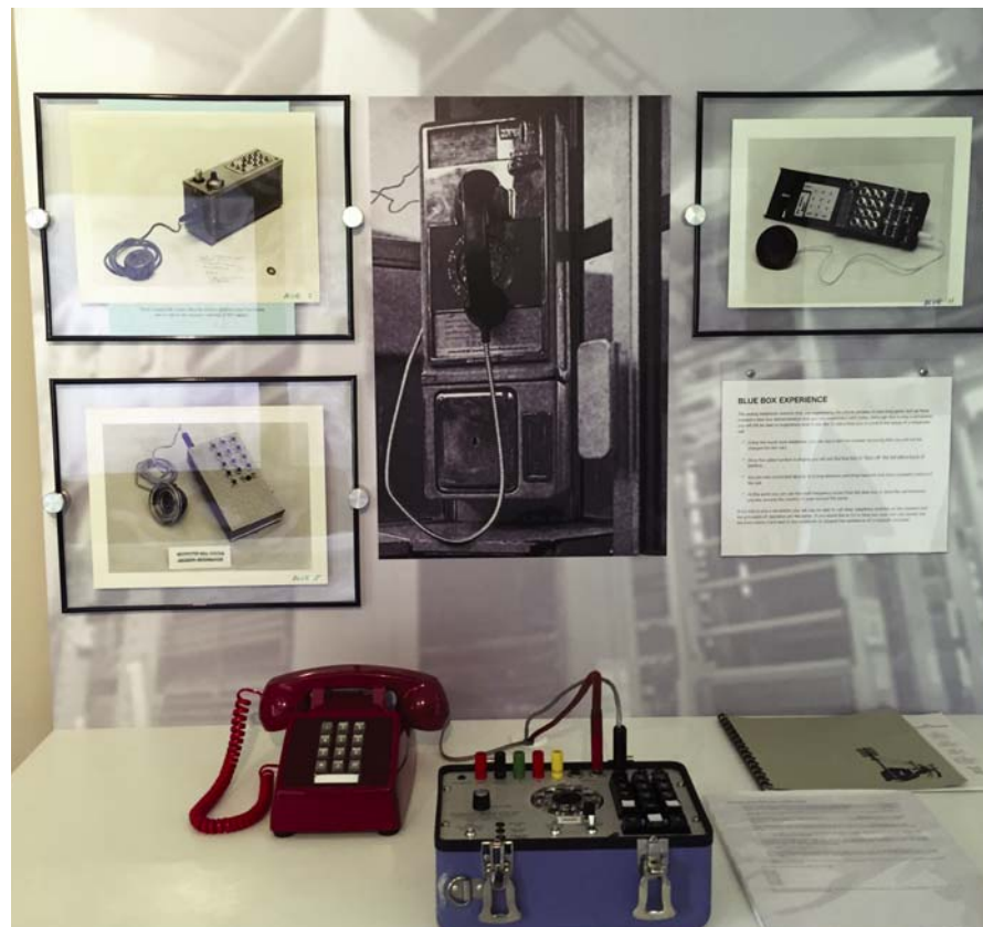
Displays at the Telephone Museum in Ellsworth trace the history of hard-wired communications.

HOUSED IN A HISTORIC Kingfield schoolhouse, (just up the hill from the Ski Museum of Maine) is the Stanley Museum, which celebrates the inventive