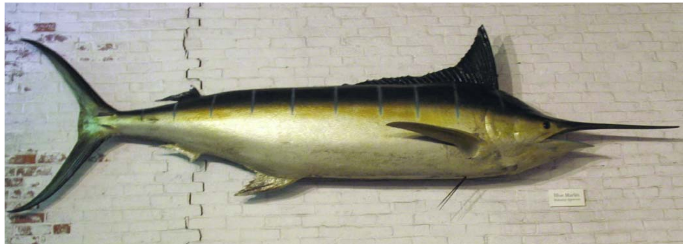
This blue marlin caught by Ernest Hemingway in the 1930s off the Bahamas is one of the many intriguing items on display at the L.C. Bates Natural History Museum in Hinckley. Apparently Hemingway hired a Bangor taxidermist to mount the fish, but never got it back, and it ended up at the museum.

Y EARS AGO, the American road trip was about much more than getting from point A to point B in the most efficient way possible. In the pre-Interstate years, travel was a blue highway adventure, a way to discover the authentic nature of a region.