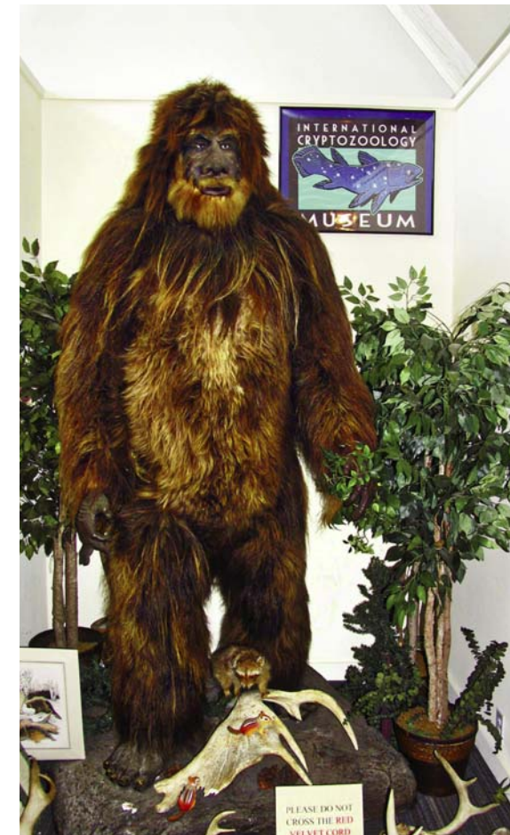
Is he real or not? This 8' tall replica of the Crookston Bigfoot (from Crookston Minnesota, which is the Bigfoot capital of the world) stands guard at the International Cryptozoology Museum in Portland.

Visitors can make a call from a wall-mounted, hand-crank magneto phone to an operator at a wooden manual switchboard, and progress to the mechanical switching of the 1980s. You can even call Frenchboro Island (metaphorically) as the island's central