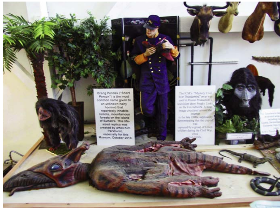
This display at the Cryptozoology Museum includes models of a curious Orang Pendak (Indonesian for short person), a purported Civil War era Pterosaur aka Thunder Bird, and a Bigfoot head.

patterns and that could even cure cancer if properly harnessed. In the late 1940s he built a stone laboratory, an orgone energy observatory that he called