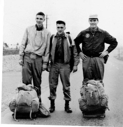
September 2, 1962: The team gathers on Kenmount Road in St. John's to begin their journey