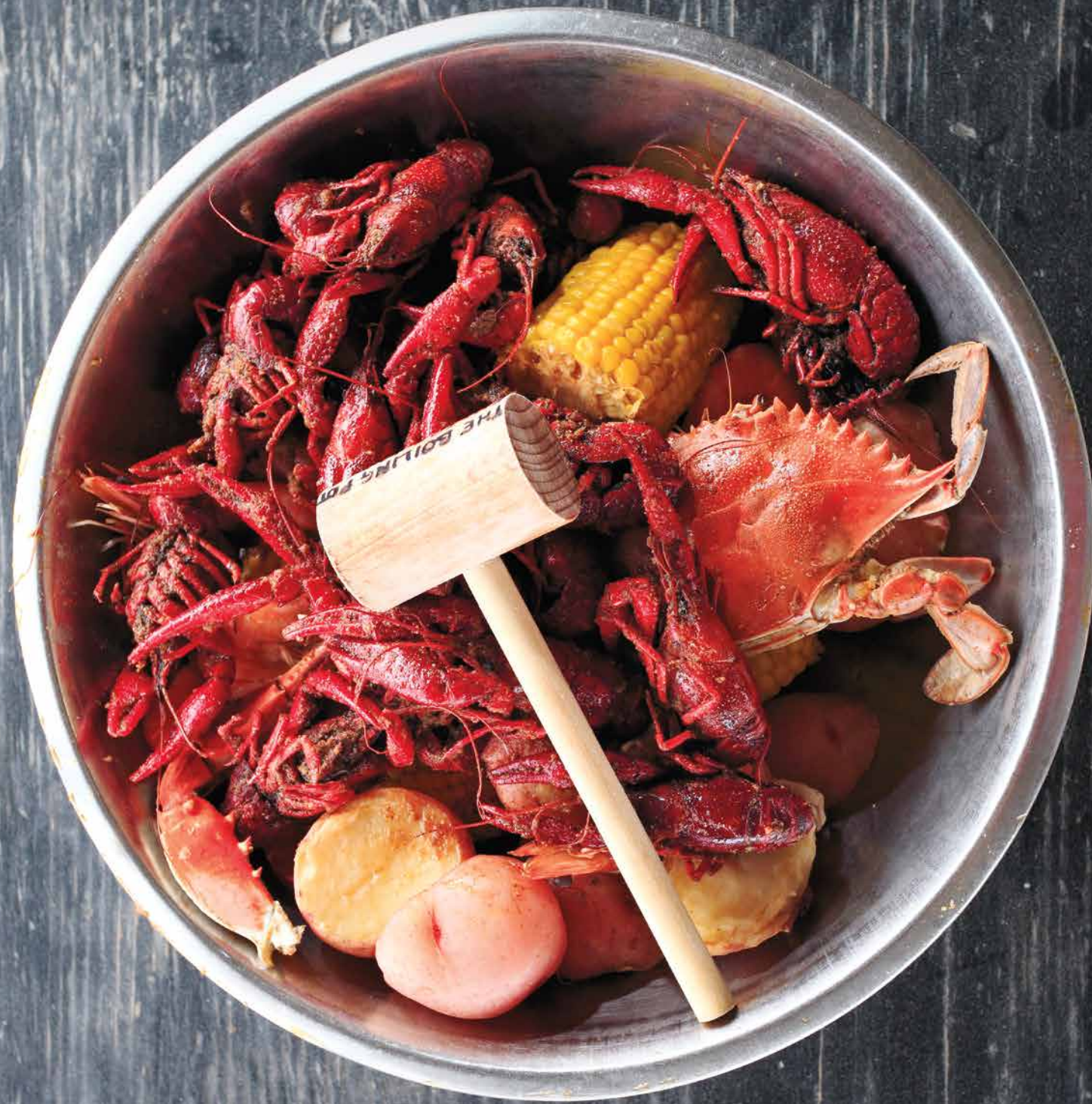
Use your mallet! A crawfish boil at the Boiling Pot, Rockport/Fulton.