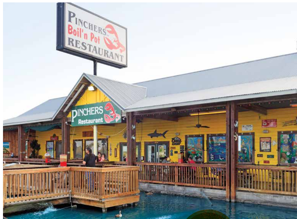
Photos on this spread: Pinchers in El Campo farms its own crawfish and brings them live to holding tanks at the restaurant, where kids and adults alike can watch the mudbugs' antics.