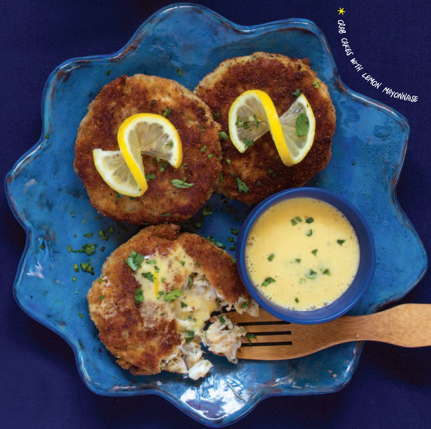
* CRAB CAKES WITH LEMON MAYONNAISE

This recipe can be partially prepared in advance. After the crab mixture is formed into cakes, the cakes can be covered and refrigerated until later in the day when it is time to cook them. A number of variations in the recipe are possible, such as substituting unsalted cracker crumbs for bread crumbs, using clarified butter or a mixture of butter and oil for frying.