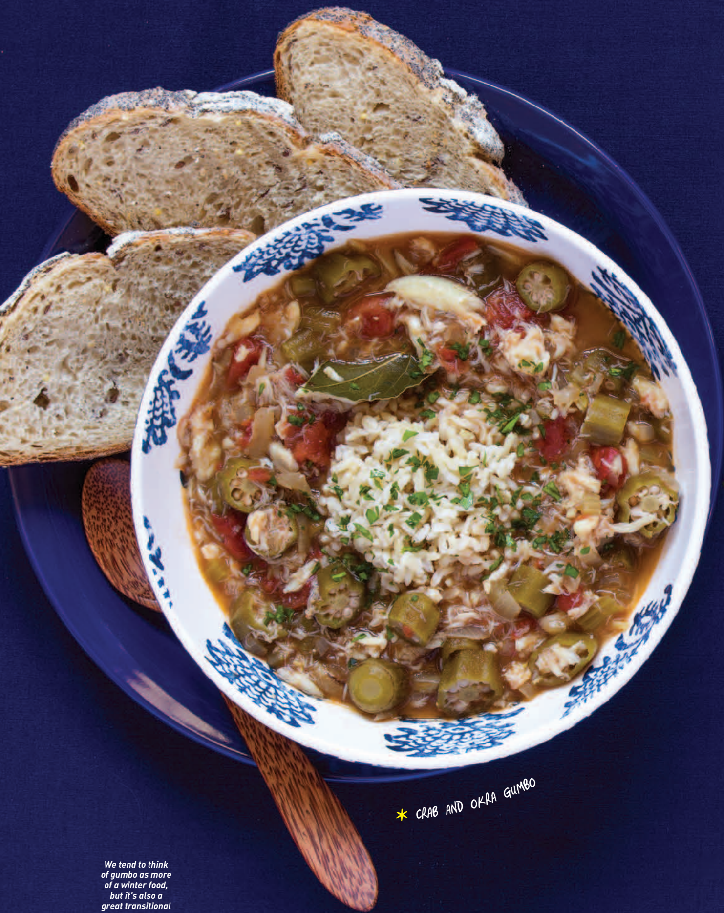
* CRAB AND OKRA GUMBO

We tend to think of gumbo as more of a winter food, but it's also a great transitional springtime menu item., especially when it contains seafood.