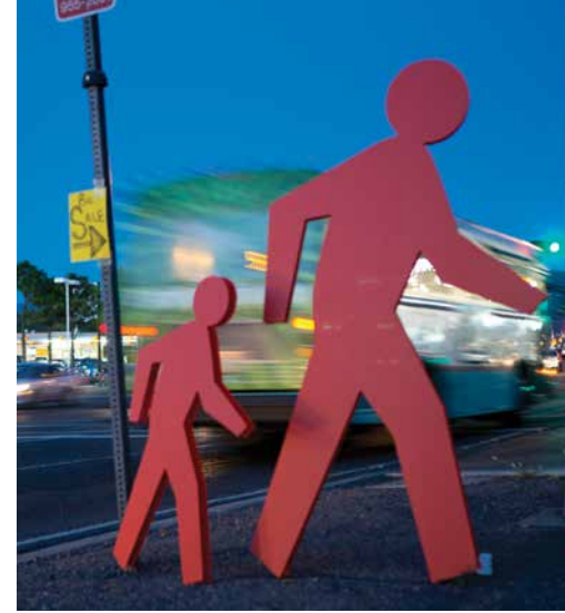
Clockwise from far left: On a balcony overlooking the Plaza, Draft Station serves NM's primo craft brews. There's an effort afoot to make the town more walkable. Agave Lounge demonstrates that there's more to local cocktail culture than margaritas. Wise Fool brings circus arts to the Railyard.