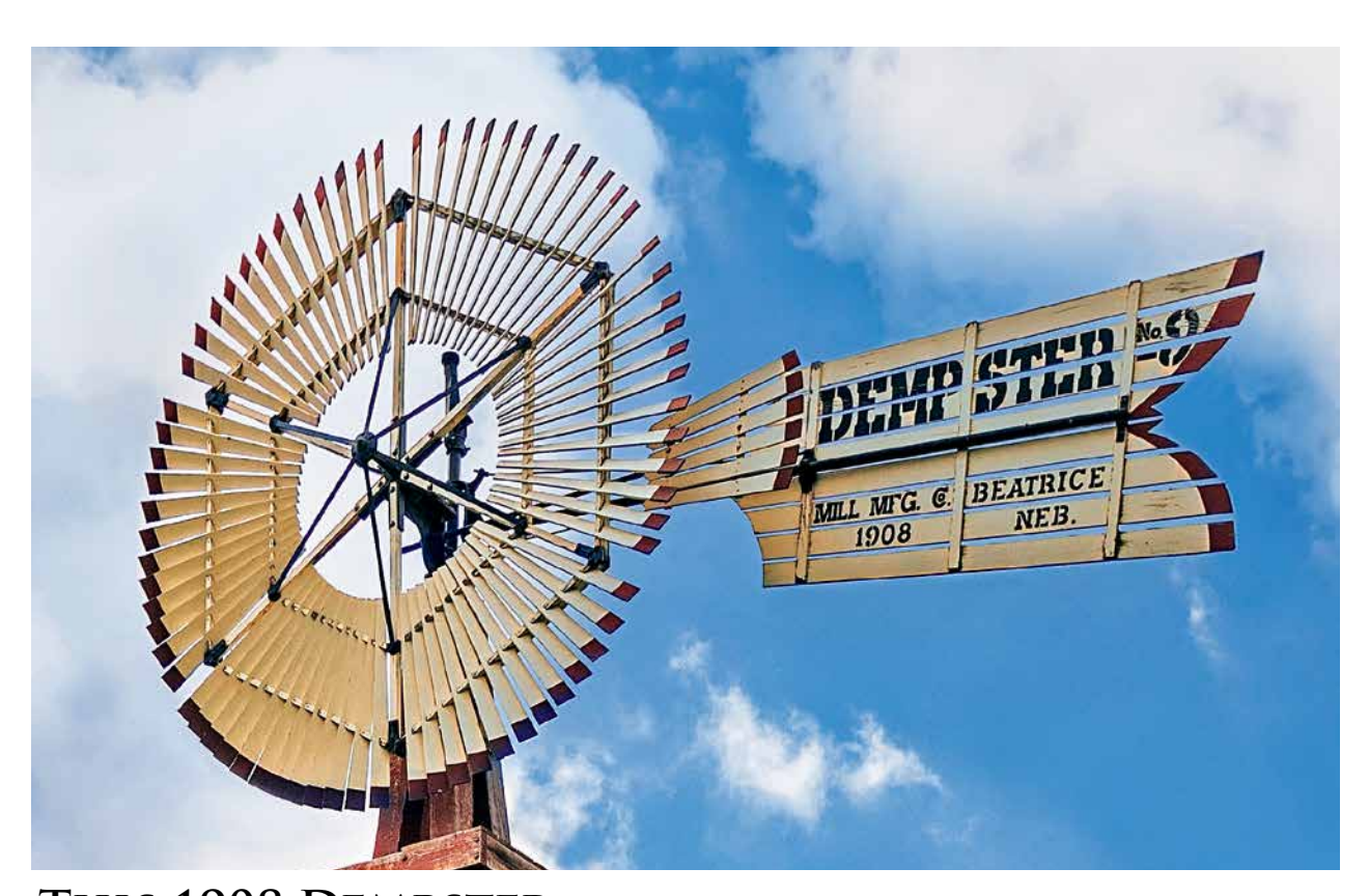
THIS 1908 DEMPSTER is one of three windmills at Windmill State Recreation Area.