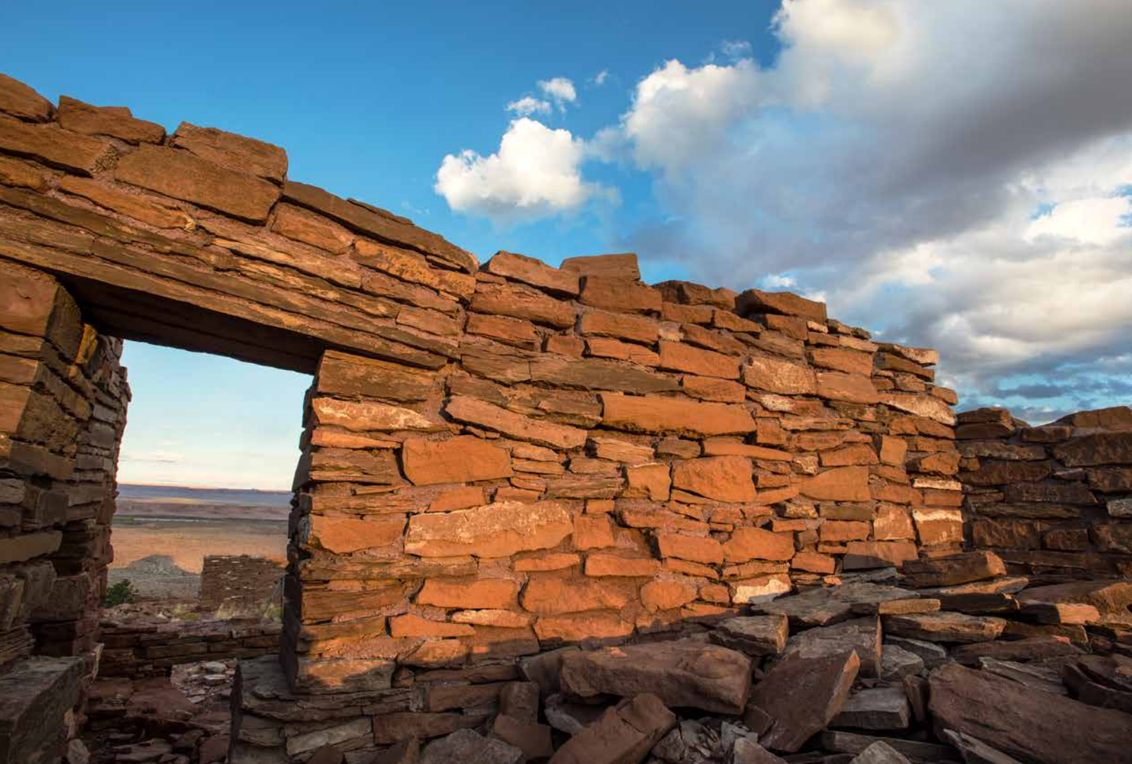
LEFT: Crack in Rock Ruins is part of Wupatki National Monument, which once served as a home for the Sinagua, Cohonina and Kayenta Anasazi people. BELOW: A petroglyph panel, one of many at the ruins, tells a creation story.

place in the dirt with my pen so I can return it exactly where I found it. Despite its size, the piece is heavier than I expected, and I imagine that whatever bigger vessel it must have been part of would have been substantial.