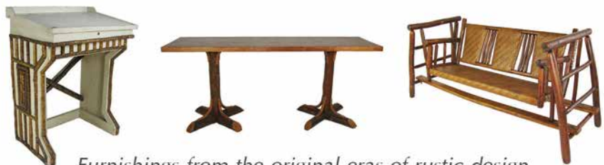
Furnishings from the original eras of rustic design