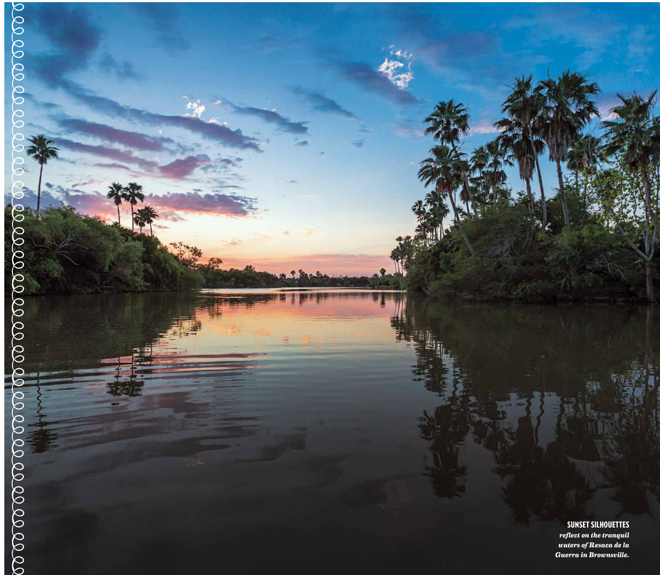
SUNSET SILHOUETTES reflect on the tranquil waters of Resaca de la Guerra in Brownsville.

See the following pages for sites along the resacas.