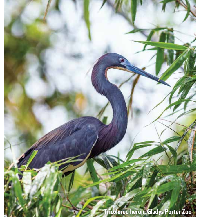
Tricolored heron, Gladys Porter Zoo

● The Gladys Porter Zoo opened in 1971 along Town Resaca, which flows through downtown Brownsville. The waterway forms a natural boundary for the exotic species of animals found at the zoo. Bridge walkways span the zoo grounds, which have also become a sanctuary for such native species as chachalacas, egrets, herons, cormorants, and black-bellied whistling ducks. www.gpz.org .