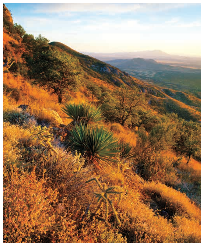
Coronado National Memorial's Montezuma Pass offers a view south into Mexico.