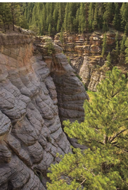
Walnut Canyon is home to some of the Southwest's most accessible cliff dwellings.