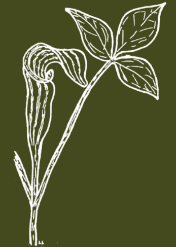
INDIAN TURNIP SKETCH BY LAURIE LACEY

From chamomile to calm, echinacea to ward off colds, and bitter young dandelion leaves to aid digestion. These are but a few herbal remedies that were commonly found in our grandmother's cupboards, and even longer ago in ancient apothecaries, when we were much more in tune with the medicinal qualities of plants. Today, a walk in the woods, on the beach, or in our own yard can still reveal a bounty of herbal medicines ready for the picking, including everything from flowers and leaves to roots, bark and berries. Atlantic Canadian herbalists and native healers believe that there is room for a more traditional view on health that includes medicinal herbs, and they've been gathering quite a following.