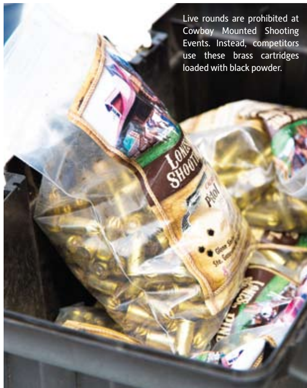
Live rounds are prohibited at Cowboy Mounted Shooting Events. Instead, competitors use these brass cartridges loaded with black powder.

competitors, and enforcing the rules. Along with his many responsibilities to the club, he owns and operates two businesses.