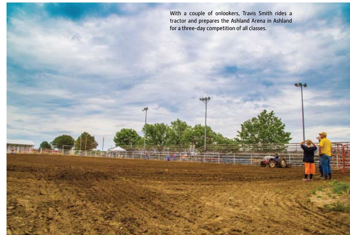
With a couple of onlookers, Travis Smith rides a tractor and prepares the Ashland Arena in Ashland for a three-day competition of all classes.

Ask some mounted shooters, and they'll tell you that one of the hardest things to achieve in Cowboy Mounted Shooting is consistency, not just shooting from the horse but being consistent