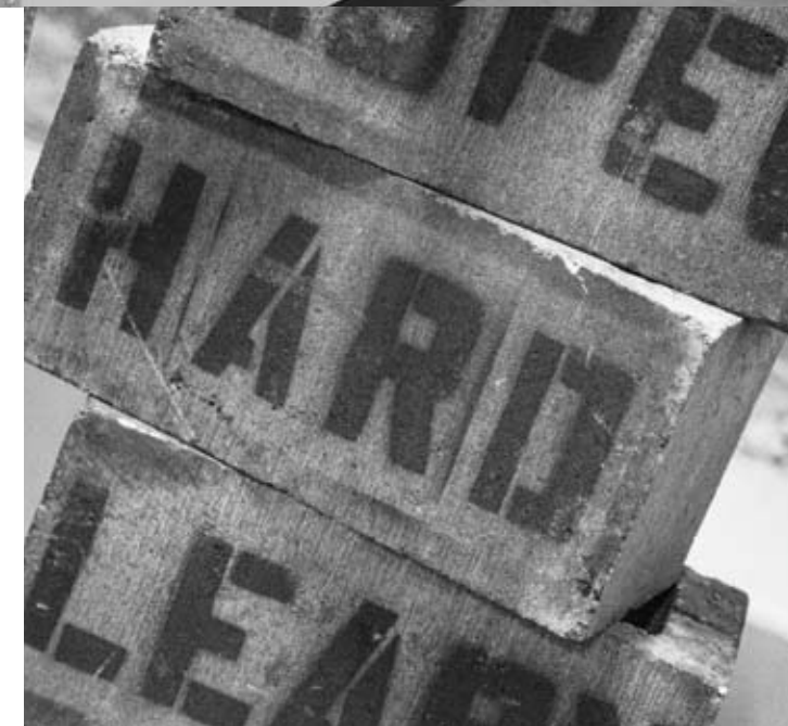
Five cinder blocks emblazoned with the nonprofit's values greet visitors to the offices of The Mission Continues. TMC staffers use them for team-building activities during field days.

As a writer, he said, you understand the power of the narrative, our personal stories. You learn that our own stories are meaningful, and you realize the opportunity to make meaning of them. The gist, to