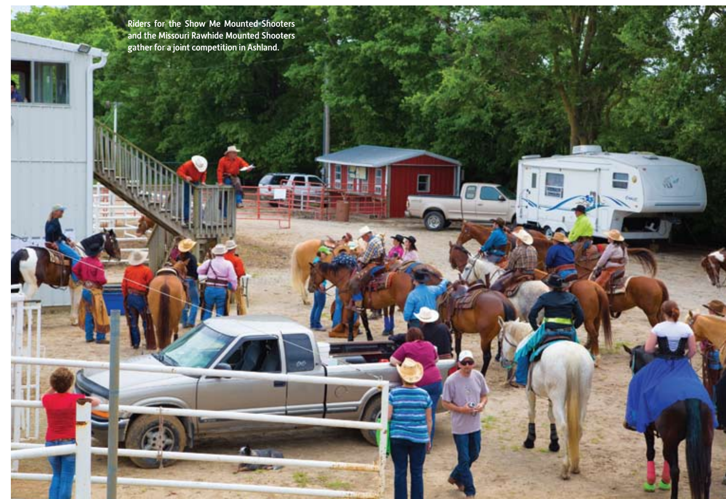
Riders for the Show Me Mounted Shooters and the Missouri Rawhide Mounted Shooters gather for a joint competition in Ashland.