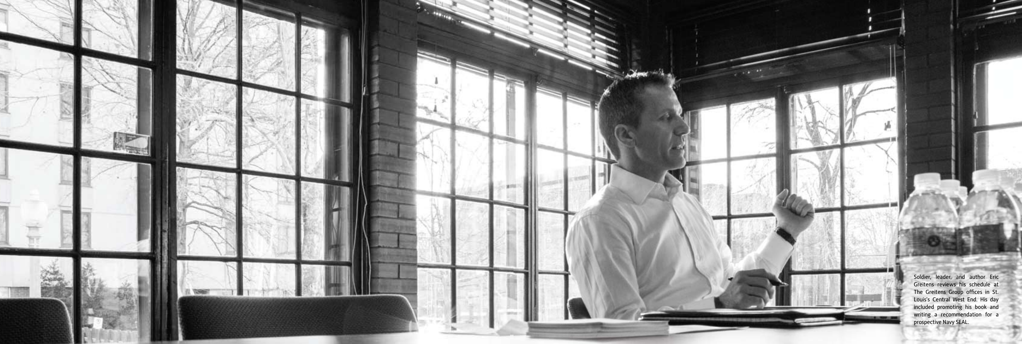
Soldier, leader, and author Eric Greitens reviews his schedule at The Greitens Group offices in St. Louis's Central West End. His day included promoting his book and writing a recommendation for a prospective Navy SEAL.