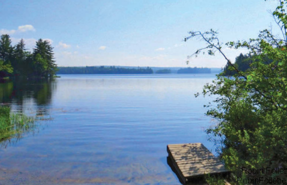
Spednic Lake is clear and calm, perfect for a fishing expedition.

East Grand Lake is one of those Maine treasures that is relatively unknown to the outside world. At 16,000 acres, it's one of the largest lakes in the state, long and irregular with deep narrow rocky bays and sandy reefs that are home to an impressive variety of fish, from those smallmouth bass to landlocked salmon, trout, and togue, as well as less desirable sticklebacks, bullhead, and suck-