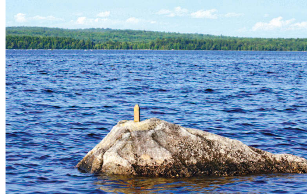
Spednic Lake divides Maine from Canada. The small stake in this rock marks the boundary line.

Pickles were one of her great specialties. The table was never considered ready for a meal until it had two or three