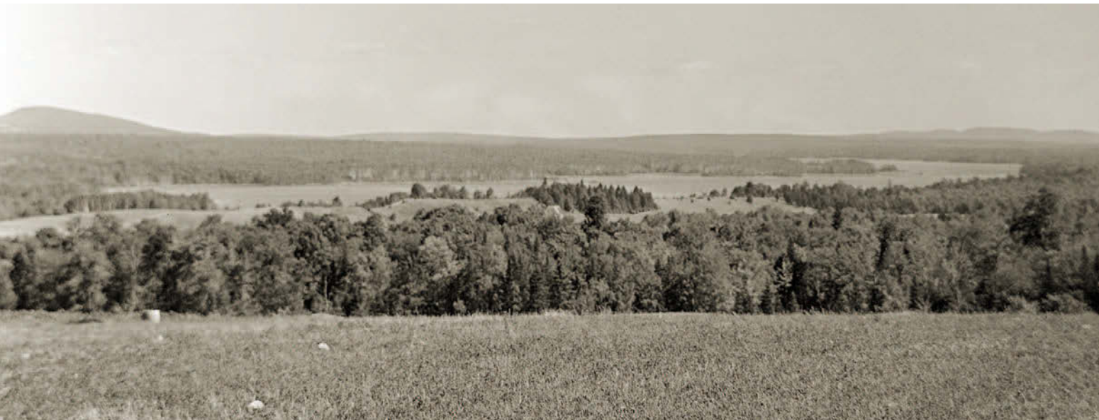
East Grand Lake as it looked in the 1950s when the author used to visit her aunt and uncle as they “rusticated” there during the summer months.

(Opposite) Courtesy Penobscot Marine Museum. (This page) Photo by Robin Follette.