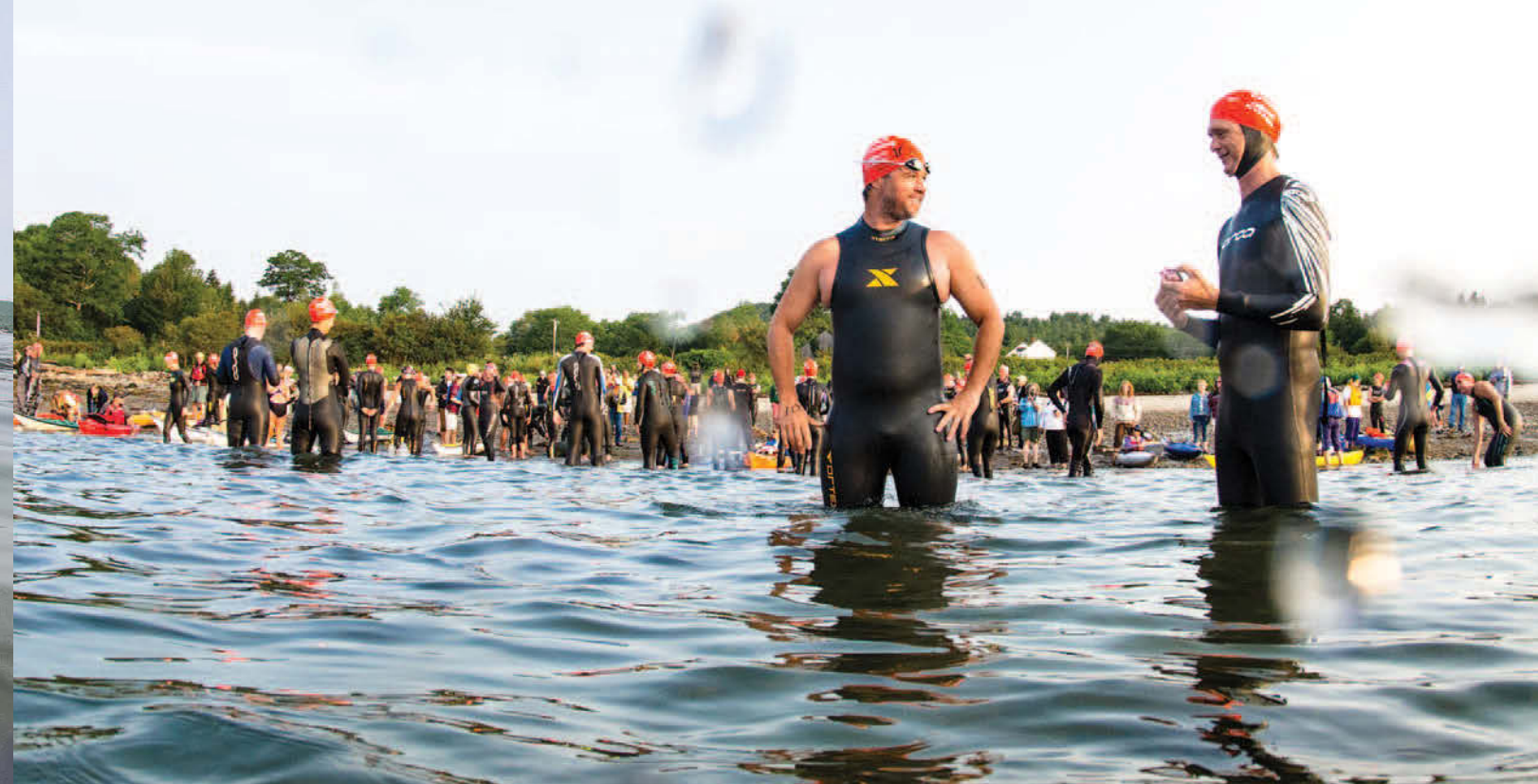
The 3.1 mile Islesboro crossing is one of the longest open water swims in New England. Each swimmer must be accompanied by a friend in a kayak or other small boat. This year's event raised more than $115,000 for LifeFlight of Maine, which provides critical care transport via helicopter.