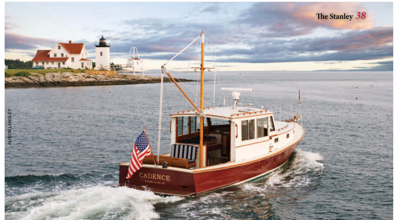
The Stanley 38