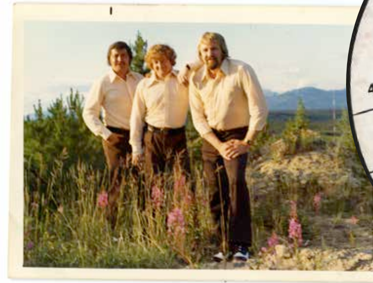
Above: The band poses in the Yukon in 1973. Right: A poster promoting a show at the Whitehorse Inn.

In the late '80s, the group started a popular Canteen Show, and when asked to play for Queen Elizabeth II's visit to Calgary, in 1990, they refused because they'd sold tickets to the show; they couldn't and