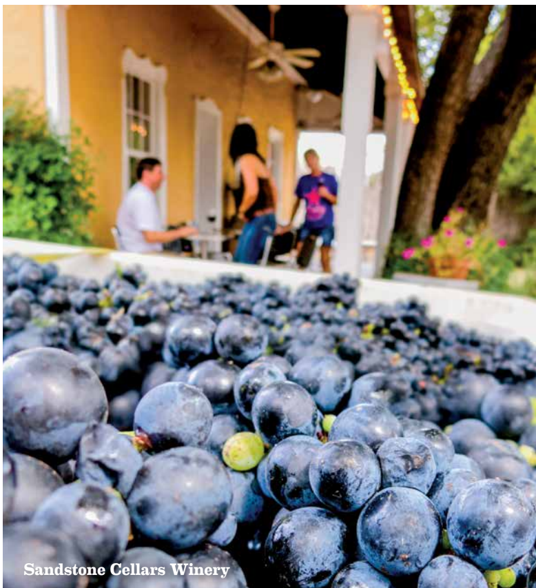
Sandstone Cellars Winery