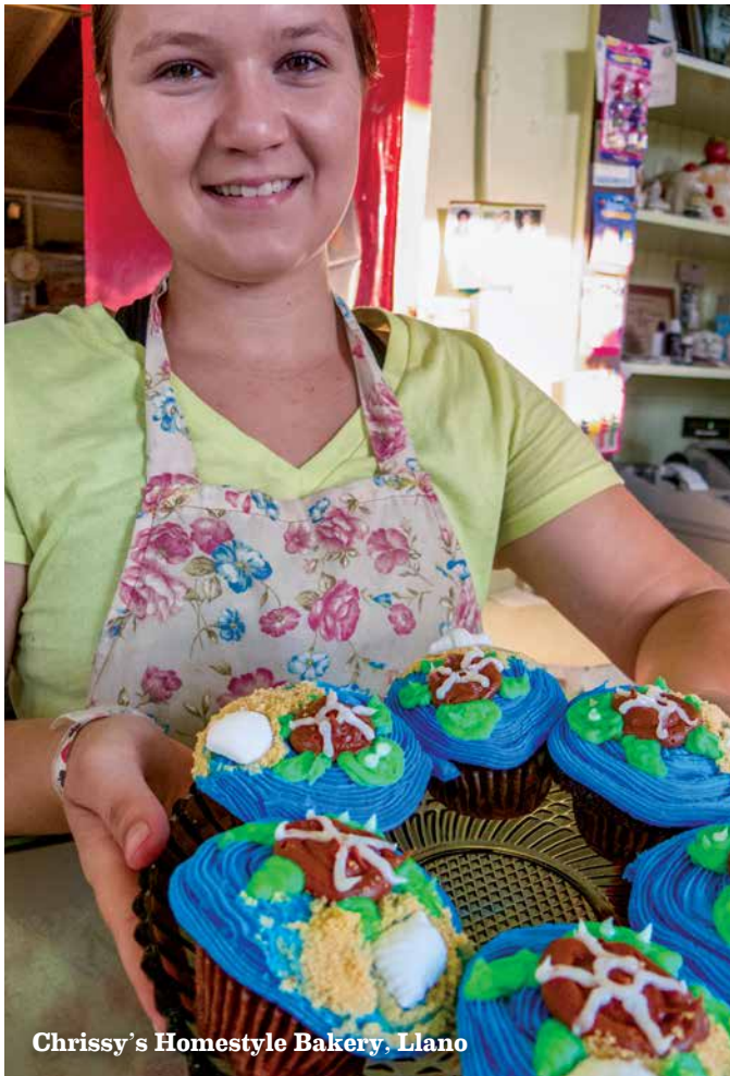
Chrissy's Homestyle Bakery, Llano