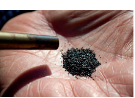
Trifillis shows off the design work on the long rifle he made, the black powder loaded into it for firing, and the flintlock mechanism. The powder used in old-style guns must be kept dry or there could be a delay of more than a second between pulling the trigger and the gunpowder igniting.