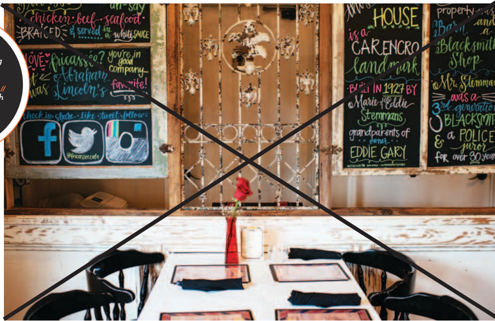
CLOCKWISE: Funky dining atmosphere // co-owner René Gary // crispy catfish appetizer