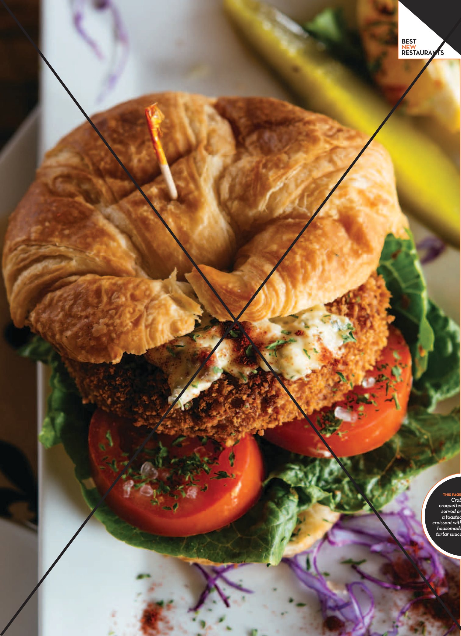
THIS PAGE: Crab croquettes served on a toasted croissant with housemade tartar sauce

3823 N. University Ave. // Carencro // 337/886-6353 // facebook.com/fricassée