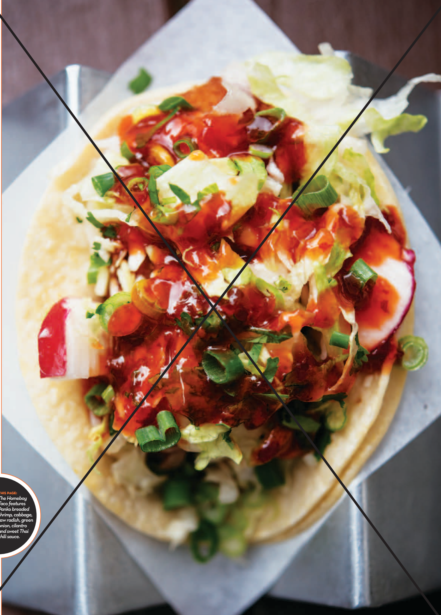
THIS PAGE: The Homeboy Taco features Panko breaded shrimp, cabbage, raw radish, green onion, cilantro and sweet Thai chili sauce.

TOP: Rustic modern dining room of Urbano's. BOTTOM: Argentino Taco with sliced steak.