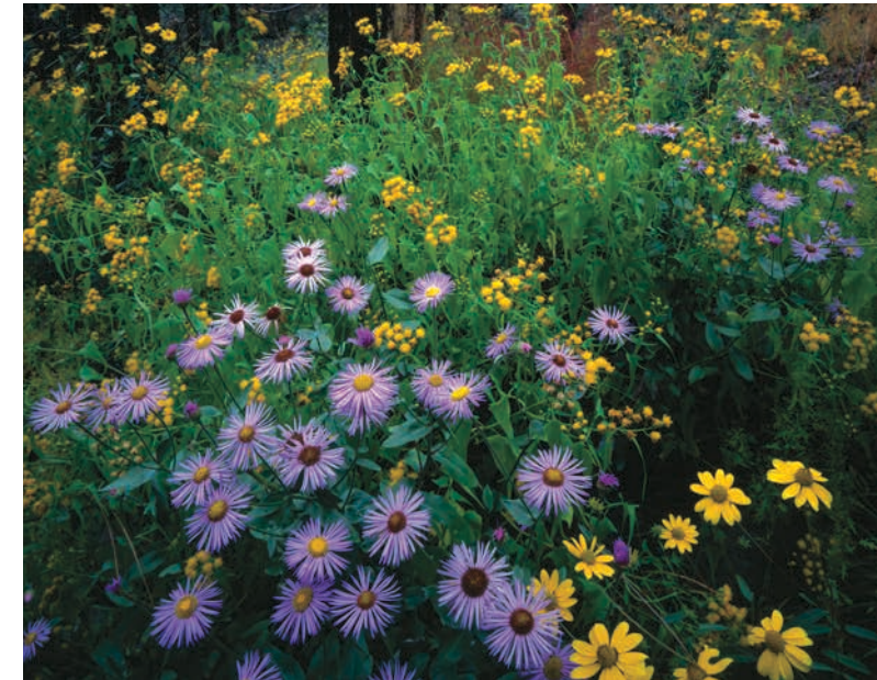
Purple showy daisies bloom amid other wildflowers near Franz Spring in Lanphier Canyon, located in the northeastern part of the Blue Range Primitive Area near the Arizona-New Mexico border.

“Too many people use the word ‘wilderness’ for anything that has trees, grass and wild animals, to actual wilderness, to forests with timber-harvesting, to someone’s naturalized yard,” Marks says. “Many designated wilderness areas and our primitive area have health problems. While naturally occurring fires can be beneficial, the ability to ‘help’ by lopping limbs before a prescribed fire — when conditions are right —