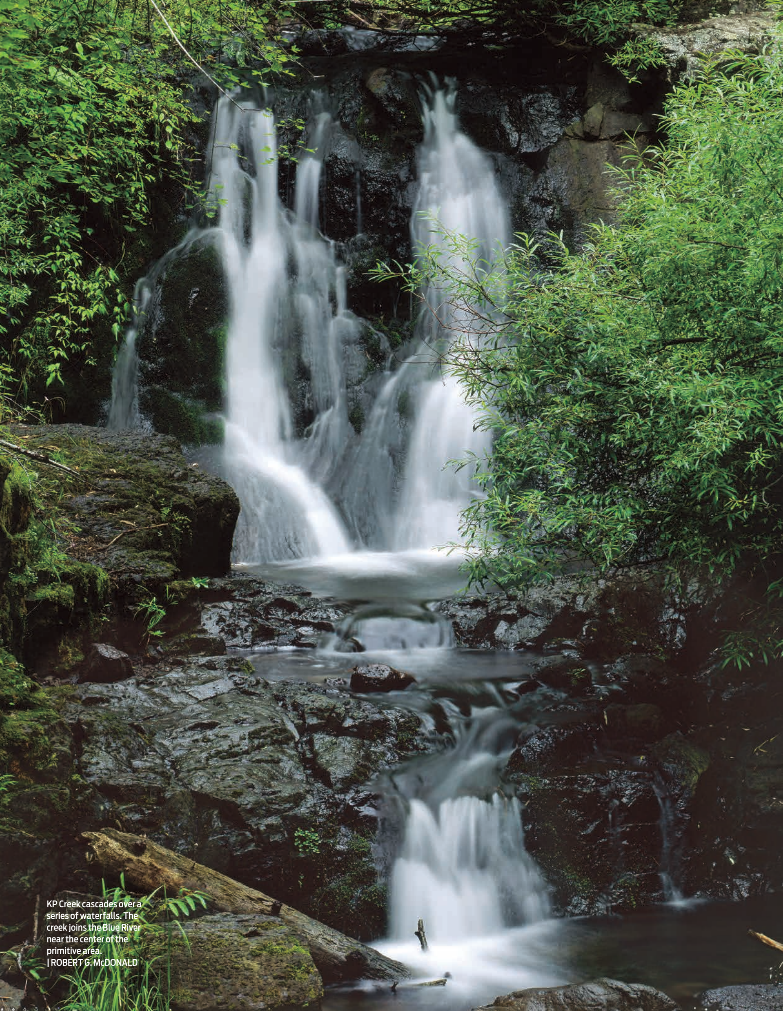
KP Creek cascades over a series of waterfalls. The creek joins the Blue River near the center of the primitive area.

“You’re on the Tige Rim Trail,” they said.