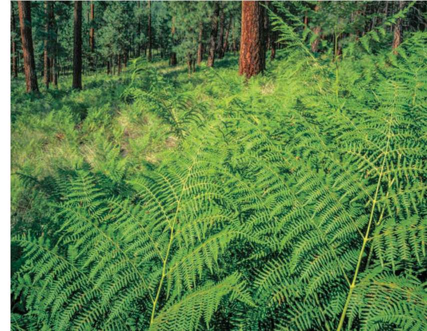
OPPOSITE PAGE: Near the unincorporated community of Blue, yellow wildflowers grow near an old corral — a rare sign of human presence in the area. ABOVE: Bracken ferns and ponderosa pines are among the primitive area's plant species.

I don't know if the Blue Range Primitive Area will become the Blue Range Wilderness in my lifetime. But I know now that I will dream it — the forest primeval, protected. HH