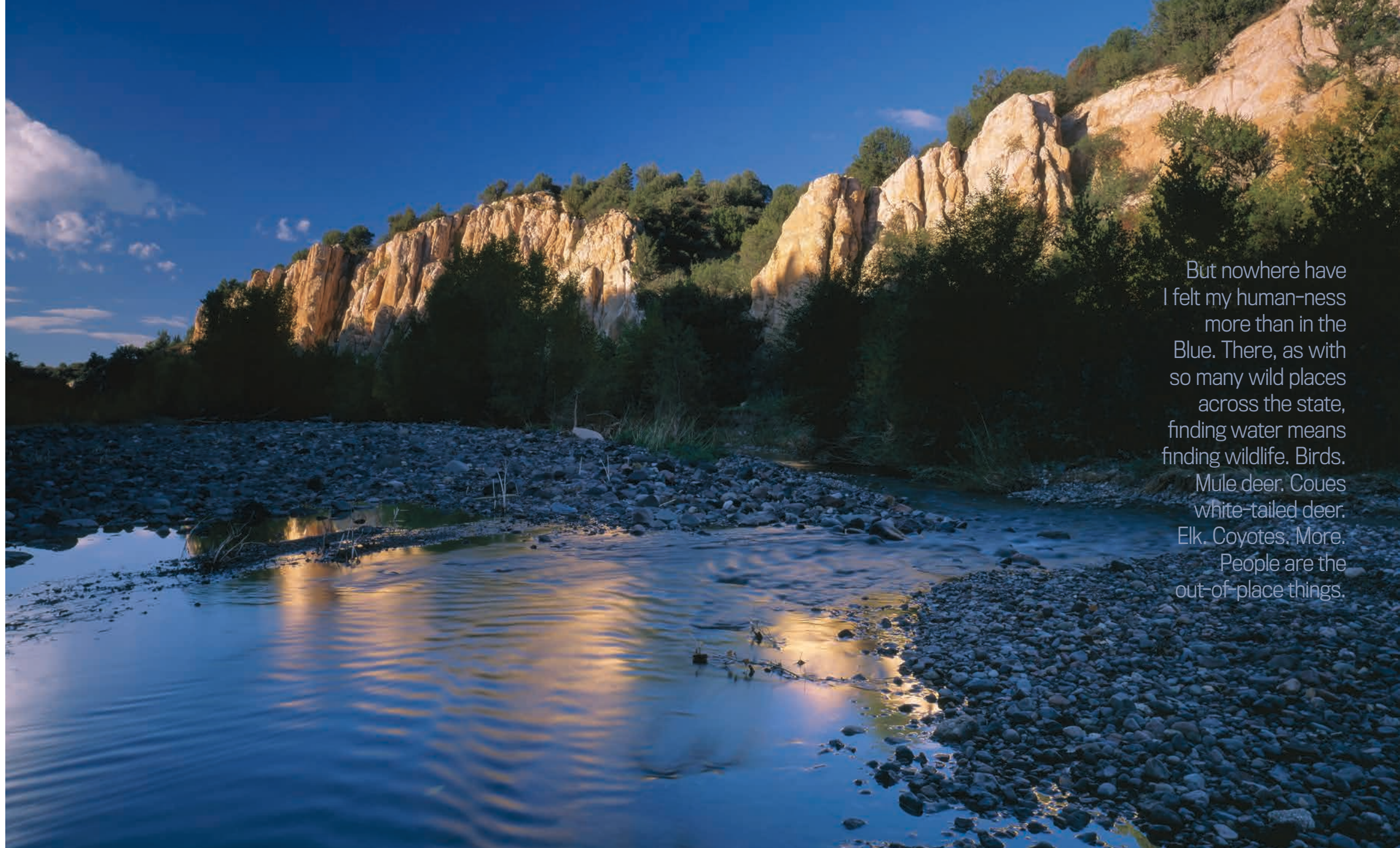
The meandering Blue River reflects surrounding rock formations covered with piñon pines. The river runs for nearly 51 miles before it joins the San Francisco River northeast of Clifton.

And that would have a tremendous environmental effect on one of the country's most pristine landscapes. As a University of Virginia study reads: "The way in which copper has been traditionally mined has resulted in the production of toxic waste products and negative changes to the immediate mine environment. The environmental consequences of the mining process are substantial and have both acute and chronic effects on the geography, water, vegetation and biological life in the surrounding areas. ... [Acid mine drainage] has had a huge